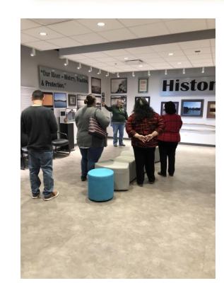
Pipa Aha Macav Cultural Center - Fort Mojave Tribe

Colorado River Museum 1239 Highway 95 (in Community Park) Bullhead City, AZ 86429 928-754-3399