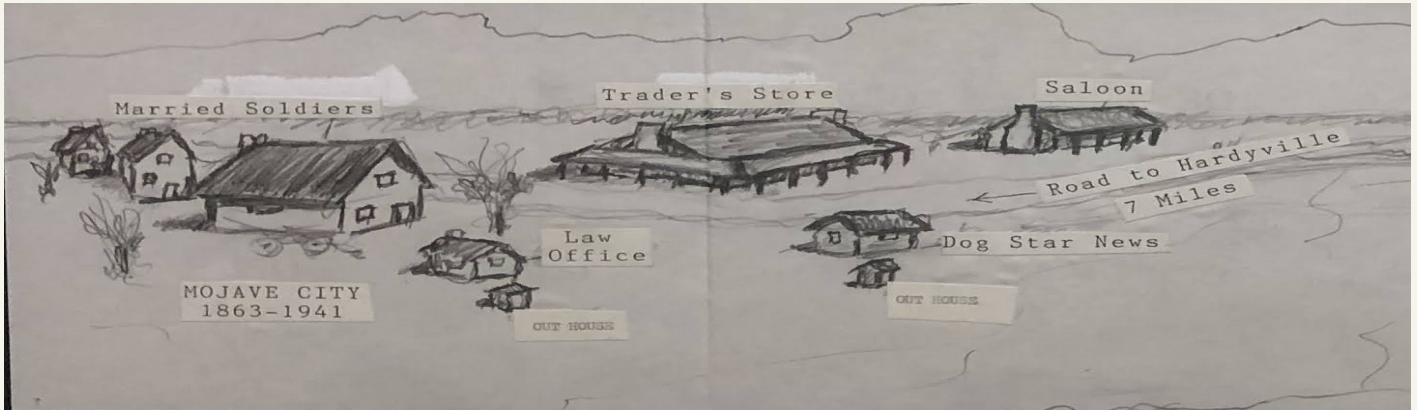
Above drawing on display in museum library

COLORADO RIVER HISTORICAL SOCIETY MUSEUM