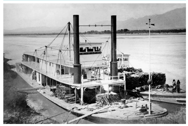
The Mohave II at Fort Mohave.

The museum is now offering an all new steamboat slide show of the boats that ran the Colorado River between 1852 and 1916. Historic photographs, descriptions and even a couple of sound effects can be enjoyed on a 32-inch monitor. The show is about 20 minutes long and includes 79 slides.