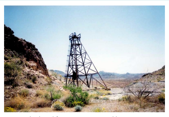
The head frame in its original location

The Moss Mine head frame now located near the museum in Community Park will soon be joined by some of the museum's mining artifacts. An ore car from the Chloride, AZ area, and a large ore bucket will be moved by the City Parks Department from our back compound into the area of the head frame. With the addition of our items it will be a more well-rounded display of early mining efforts.